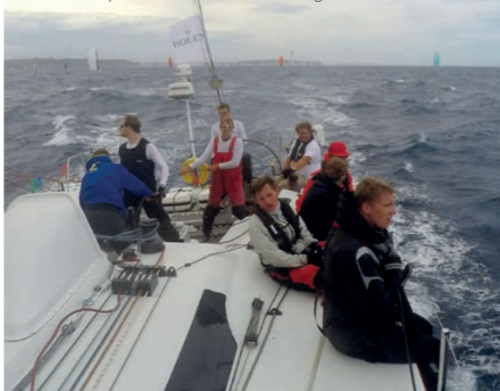
Following the start, the colorful gennaker sails of the pursuers are still within sight.

business partners from the region had the opportunity to test their sailing capabilities. At full sail and in the proper inclined position, the crew spent two days cruising on the yacht with 40 different guests, against the magnificent backdrop of the bay of Sydney. This exciting event on the water was followed by a get-together on dry land – a perfect opportunity to catch up with existing contacts. Customer events like these are planned for all the larger harbors on the Challenge, including Argentina, Uruguay, and Brazil.