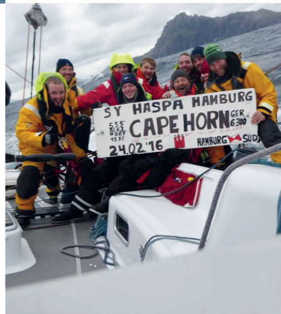
Cape Horn was rounded on February 24.