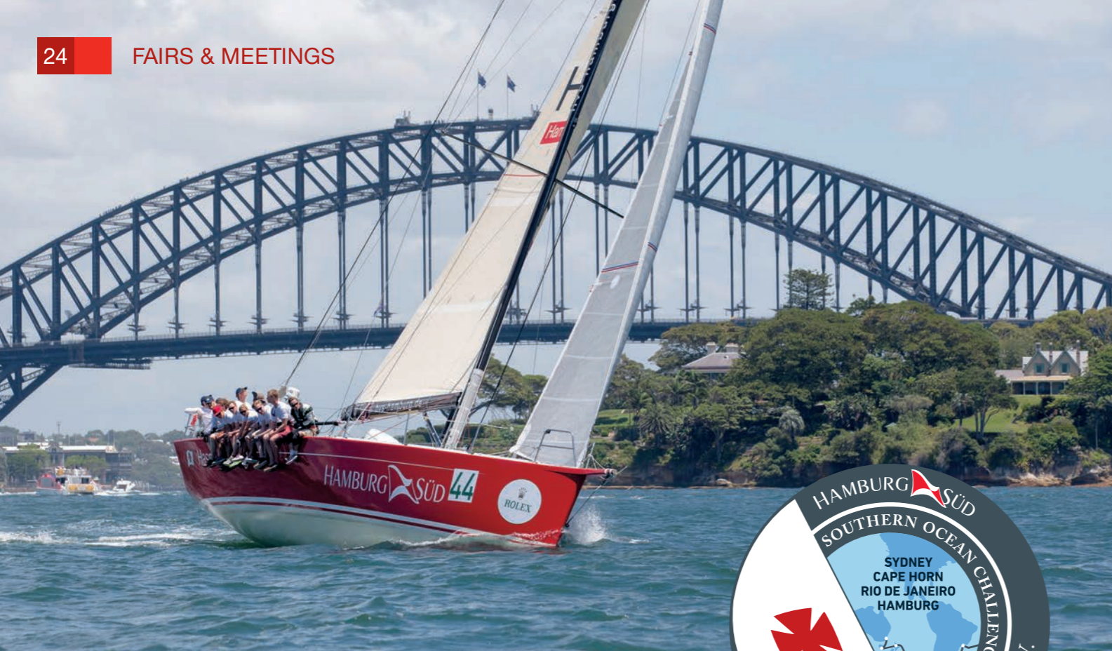
The "Haspa Hamburg" against the backdrop of the Sydney Harbor Bridge